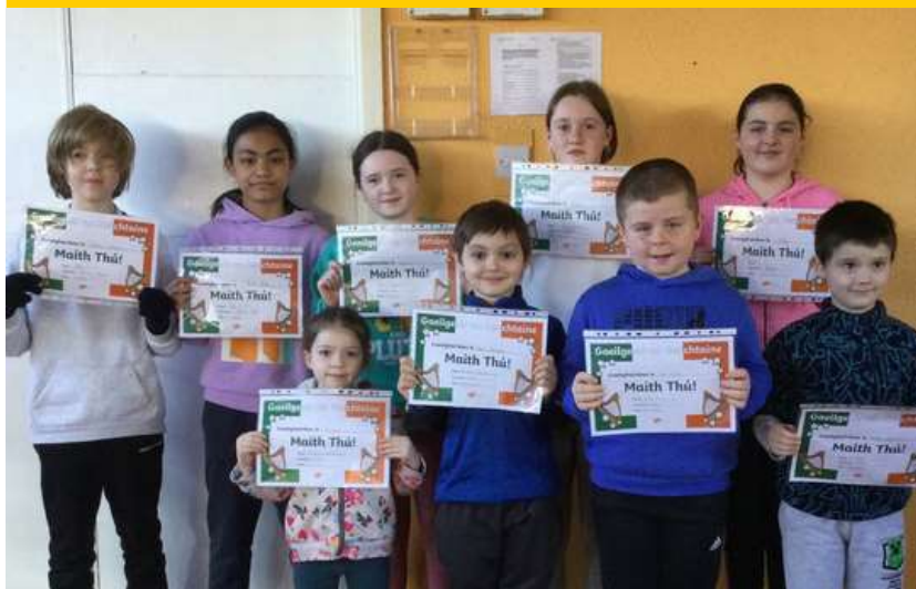
Gaelgóir na Míosa Awards