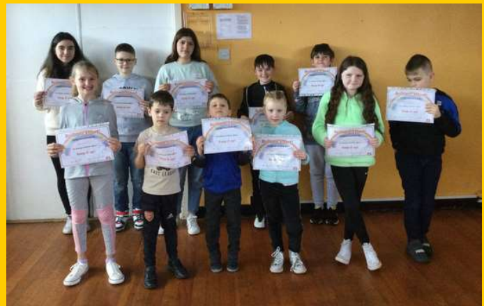
'Extra Effort' awards