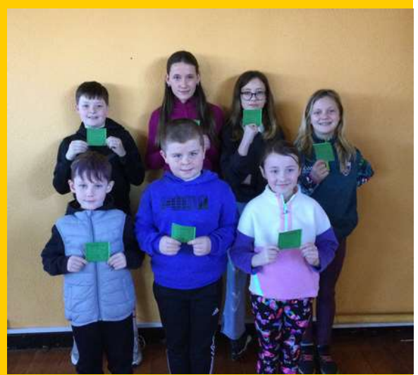
Indoor League winning team