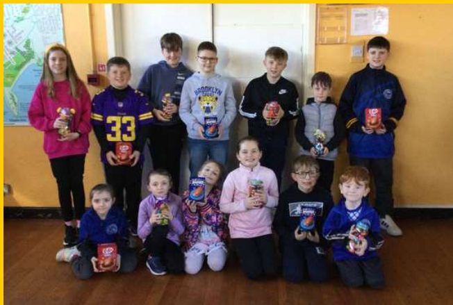
Parents' Association 'Guess the Amount in the Jar' winners